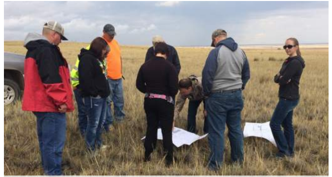
Value Engineering Study in Progress at Rocky Boy's WTP Site

Tribal Water Resources Department (TWRD) 16 Black Prairie St. Box Elder, MT 59521 (P) 406-395-4225